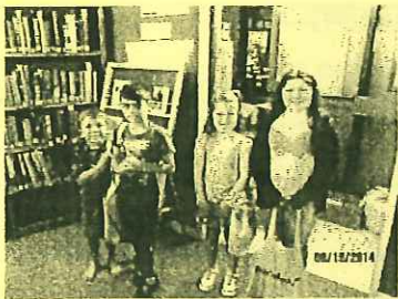
Donalda & District Museum